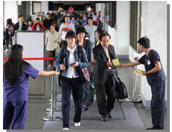
Philippine health workers hand out health declaration forms and notices to arriving airline passengers to keep them aware of the effects of swine flu.

The department is planning to coordinate with the Department of Foreign Affairs to check how precautionary measures against the disease is being implemented among American soldiers who are in the country for the Balikatan exercises.